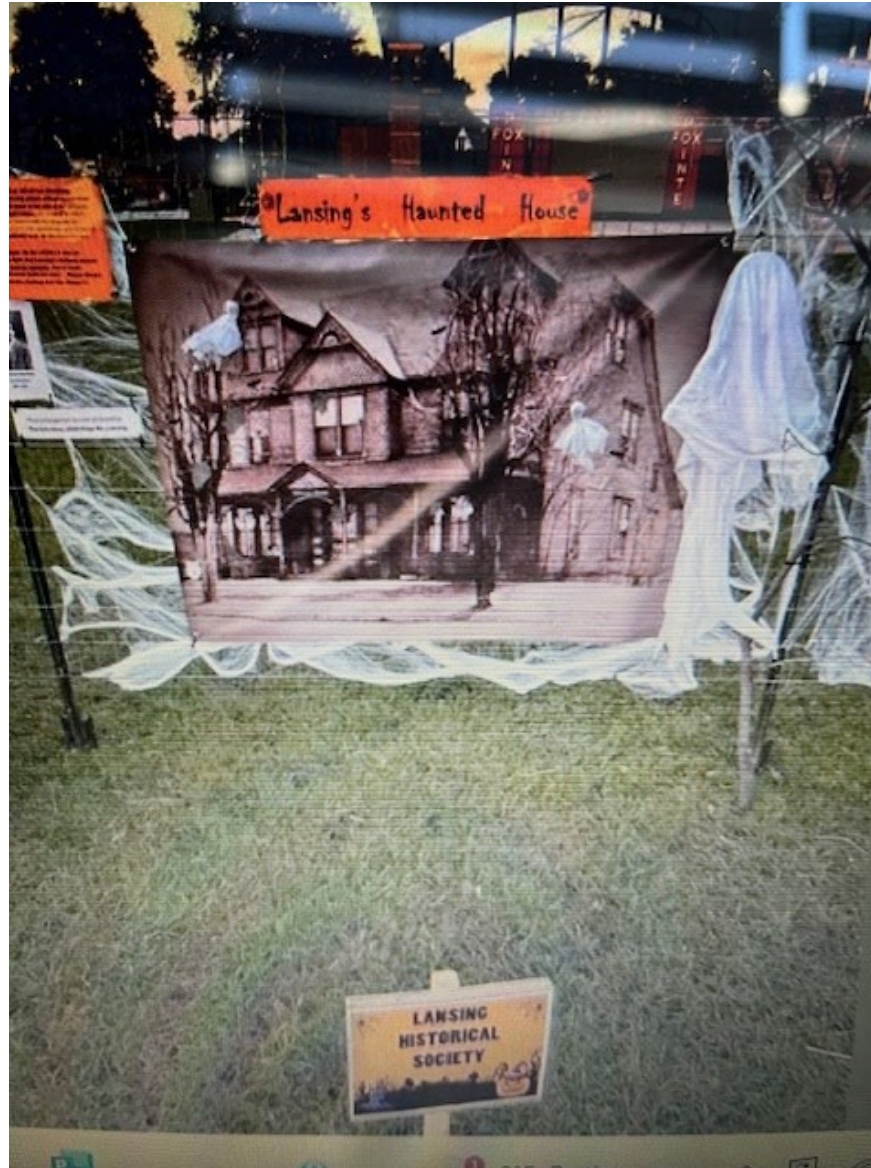
LANSING HISTORICAL SOCIETY'S "HAUNTED HOUSE" ENTRY TO FOX POINTE'S SPOOKTACULAR SHOWDOWN