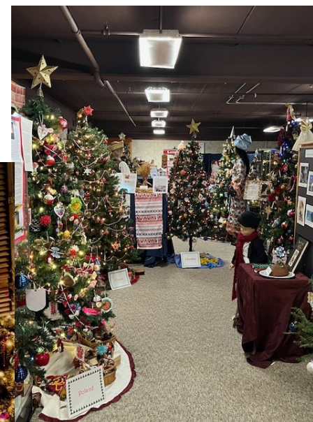
POLAND, CROATIA, UKRAINE